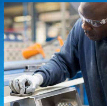
MANUFACTURING/ PARTS ASSEMBLY