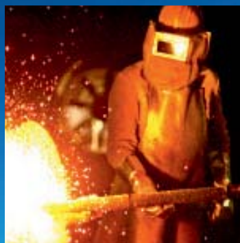
FOUNDRIES & STEEL MILLS