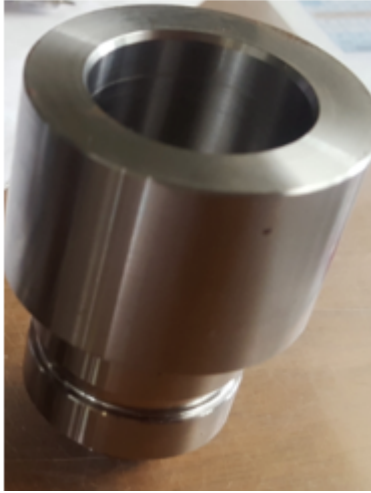
A rotor part in S45C before processing. Each workpiece requires the machining of two slots, measured 10mm in diameter and 28mm in depth.

The opportunity to evaluate new tooling options came about when Asia Precision was assigned with a new project involving automotive parts. The work involves the machining of electric oil pump rotor parts in S45C. Each vehicle requires a piece of the rotor part. The monthly production is estimated to be around 26,000 pieces. Each workpiece requires the machining of two slots, measured 10mm in diameter and 28mm in depth. The machining center used for this particular production is the Yamazaki Giken YM-850. Initially, Asia Precision was processing these parts utilizing a 7.5mm diameter carbide drill for center drilling, followed by another 2-flute 10mm diameter carbide end mill to complete the hole.