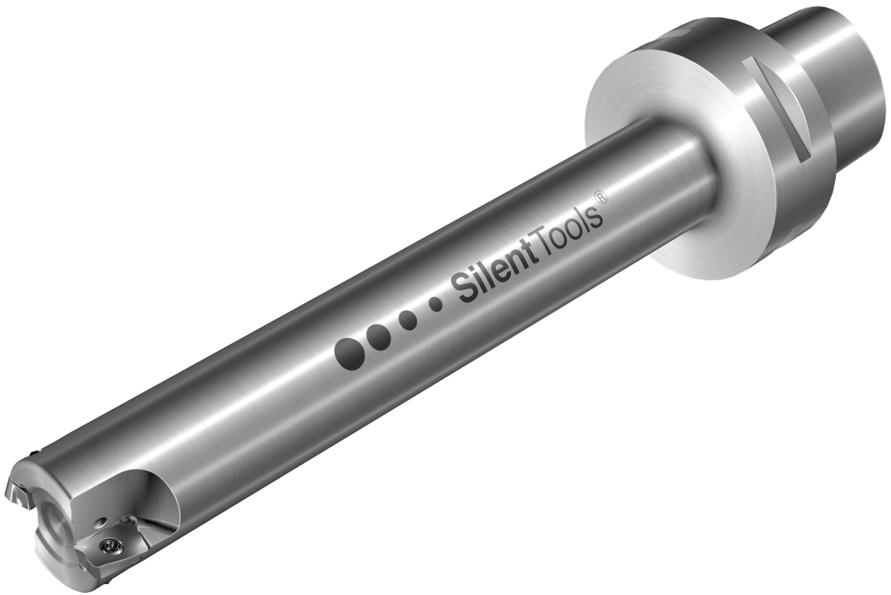
CoroMill 390 Silent Tools

CoroMill 390 covers many applications with a large, versatile program, including cutter versions for shoulder milling and long-edge milling. The cutters generate a good quality 90-degree shoulder and are ideal for ramping and helical interpolation. ✕