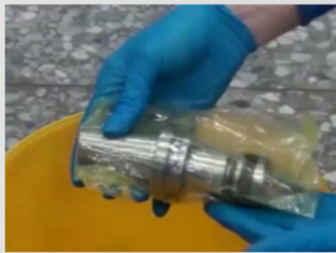
Put the toolholder in an anti-rust bag.