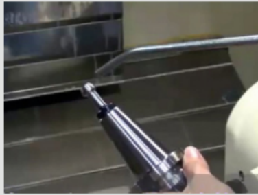
Use air to remove metal chips and dirt from the toolholder.