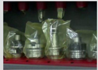
Store the toolholder on the correctly tapered rack.