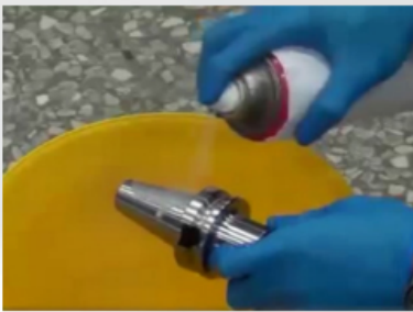
Spray the toolholder with anti-rust spray to prevent rusting