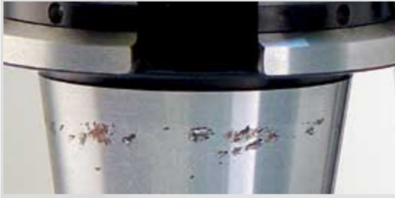
Fretting (wear marks) on a toolholder taper.