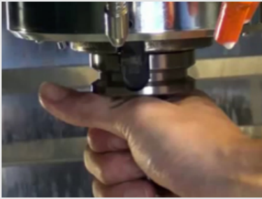
Remove toolholder from spindle when not in use.

Techniks recommends regular preventative maintenance be implemented to protect your tooling and prevent scraps.