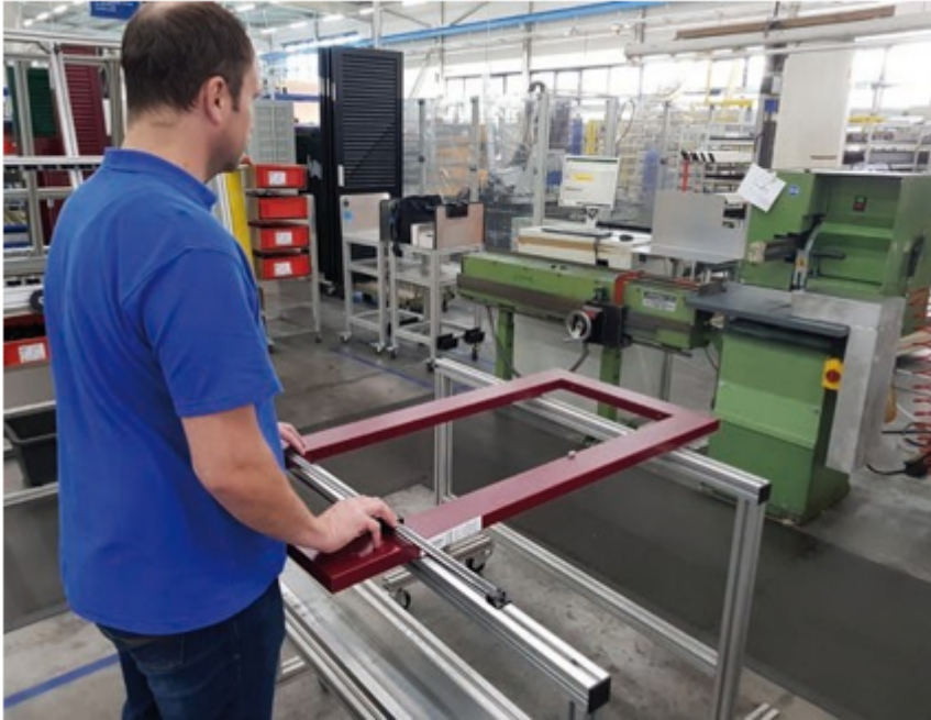
Inspection of an aluminum frame with a TESA TWIN-CAL IP67 horizontal scale unit.