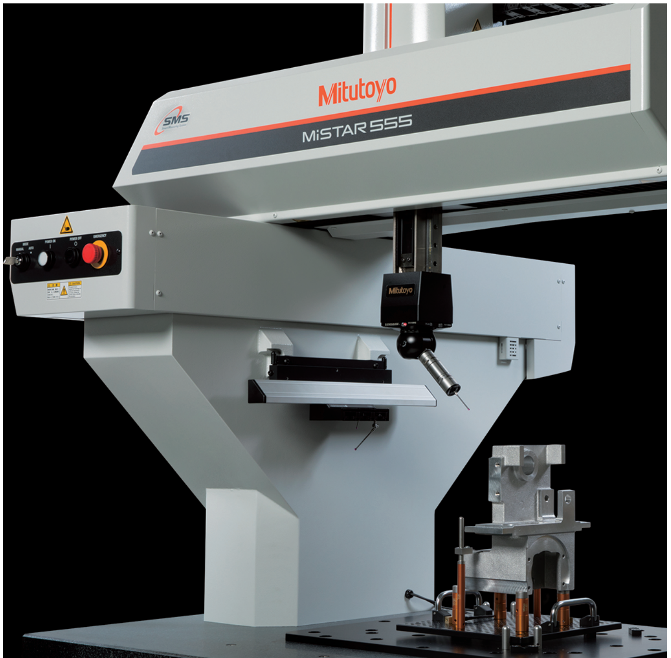
Mitutoyo's MiSTAR 555 CMM, designed for production environments, boasts an open bridge, symmetric structure and temperature compensation that guarantees accuracy from 10 to 40 degrees Celsius.

They’re referencing a software tool designed to do precisely that. MiCAT Planner “simplifies the creation of CMM part programs and reduces programming time by up to 95 percent,” the company says.