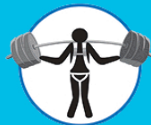
Too heavy and uncomfortable