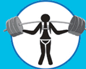
Too heavy and uncomfortable