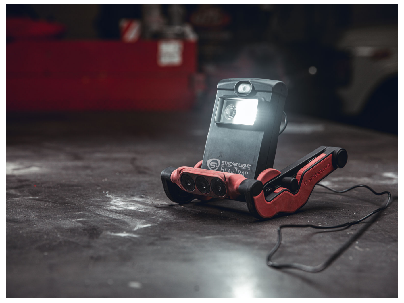
Work lights like this BearTrap rechargeable model can clamp virtually anywhere or stand on their own to light up an environment while keeping the worker's hands free.

It's crucial, then, to have a lighting tool that gives you the right kind of light for the application. "Are you trying to do work at the end of your fingertips? Trying to see across the plant floor? Working inside a machine? Doing a repair that's 50 feet up in the air?" Freund says. "Making sure that you have the right tool that gives you the right light where you need it, that's hugely important."