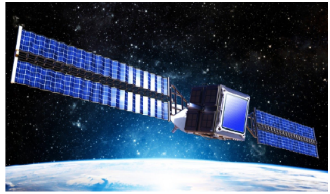
A render of a satellite equipped with a SPIDER imaging sensor in orbit.

Partnering with experts at UC Davis, the ATC co-developed a special silicon chip to channel light fed from tiny lenses. ATC's new system could reduce the size, weight, and power needed for optics by 10 to 100 times while offering similar resolution. As an array, SPIDER is cheaper, faster to produce, and lighter than the optics in traditional telescopes, making the technology easier to send into space.