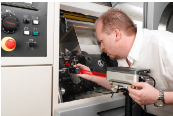
Calibrating a machine with a laser interferometer

The process foundation layer boosts margins through: