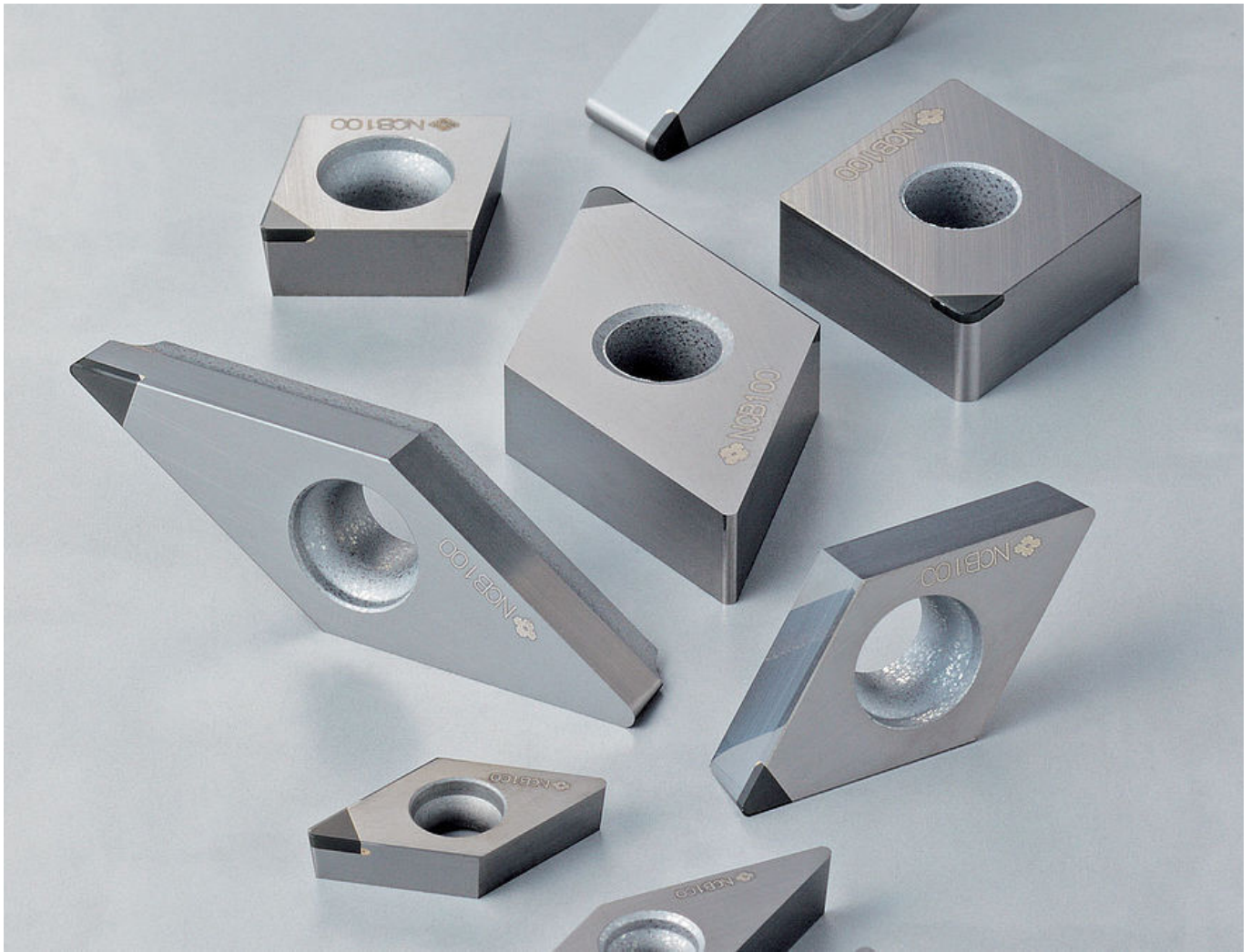
Binderless CBN (NCB100) from Sumitomo