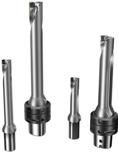
CoroDrill DS20 collection

CoroDrill DS20 indexable drills are both versatile and cost-efficient, increasing tool life and productivity in nearly all workpiece materials compared to current best-in-class concepts. No pilot drilling is needed.