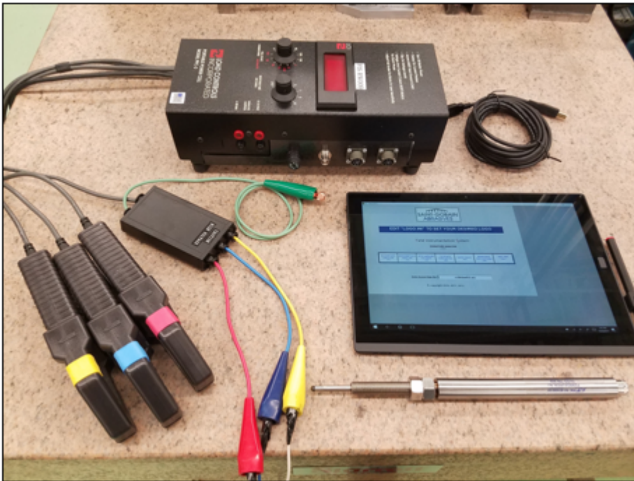
Figure 3: Field Instrumentation System used to measure three-phase spindle grinding power

machine axis movement. Norton utilizes several state-of-the-art power monitoring systems combined with customized LabVIEW software to monitor spindle power in real time during grinding. An example of the system is shown in Figure 3 .